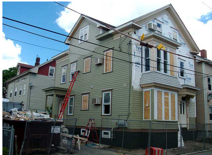
SHCDC's Latest Affordable Housing Development.