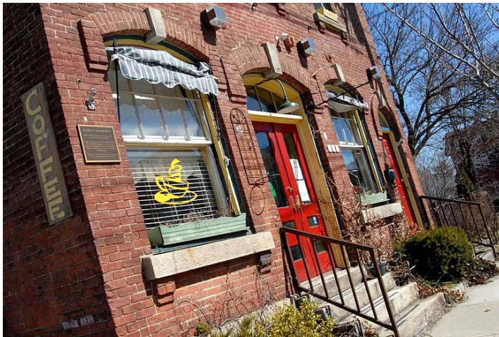
Brooklyn Coffee and Tea House, formerly the Armenian Cultural Center

[Reprinted with permission from a speech to Temple Emanu-el delivered on April 27, 2004]