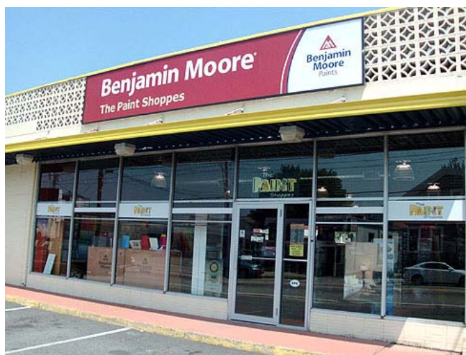
The Paint Shoppe, 274 Smith Street.

The Paint Shoppe is committed to customer service and will work tirelessly to keep customers satisfied and returning. Their community involvement includes supplying paint and materials for neighborhood clean-ups and graffiti removal days.